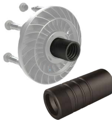
8-21100297 FPF-C SLEEVE HANDLE

Sleeve for automatic clamping wheel balancers. It screws directly onto the FASTPLATE to make work easier and faster