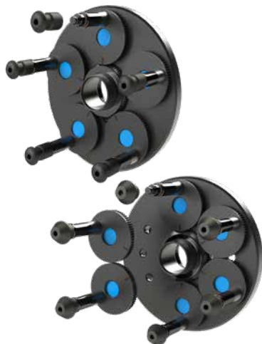
8-21100296 FPF FASTPLATE KIT

for 3- 4- 5- 6- 8-hole rims. Clamping range 95.25 - 180 mm