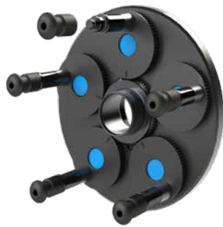
8-21100294 FPF FASTPLATE 5

for 5-hole rims. Clamping range 95.25 - 180 mm