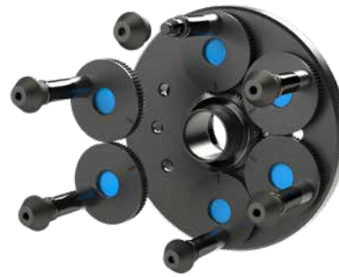
8-21100295 FPF FASTPLATE 3-4-6-8

for 3- 4- 6- 8-hole rims. Clamping range 95.25 - 180 mm